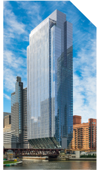
150 North Riverside