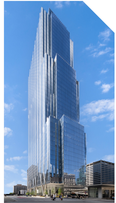
320 South Canal