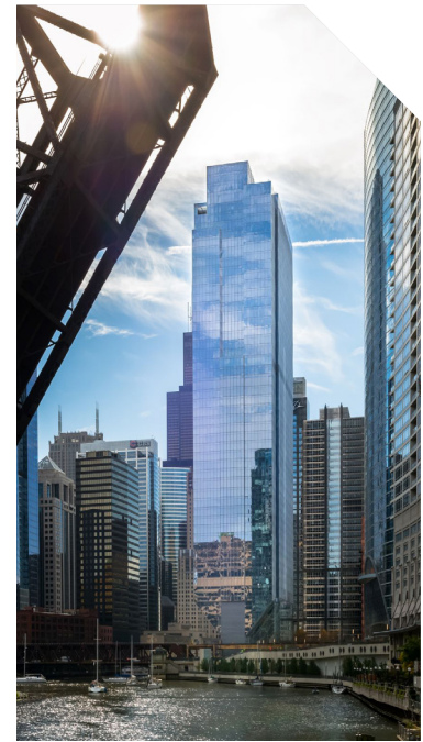
150 North Riverside