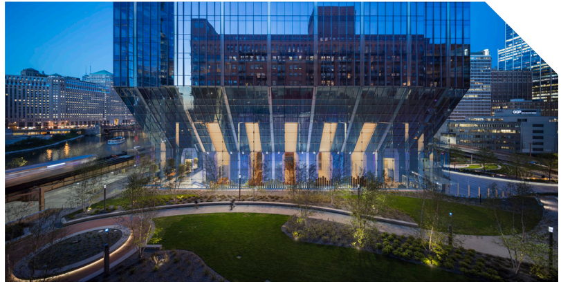
150 North Riverside